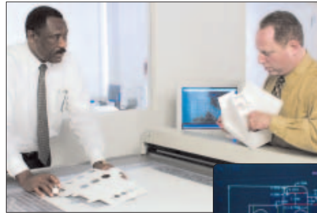
Cut out mock-ups are created through CAD as part of the engineering process

With our extensive expertise, we will ask the right questions and do what is necessary to help you get your product's packaging within three days of receiving your FDA approval!