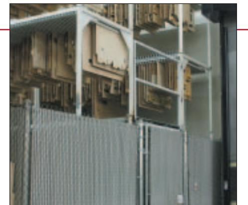
Secured storage areas for cutting dies