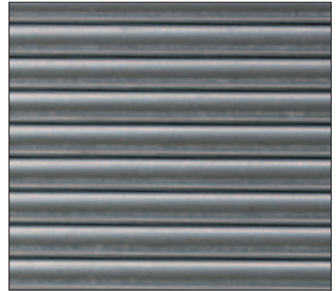
Roll-up security doors installed on all Production buildings