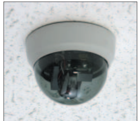
Security cameras installed to monitor finishing lines and exterior doors