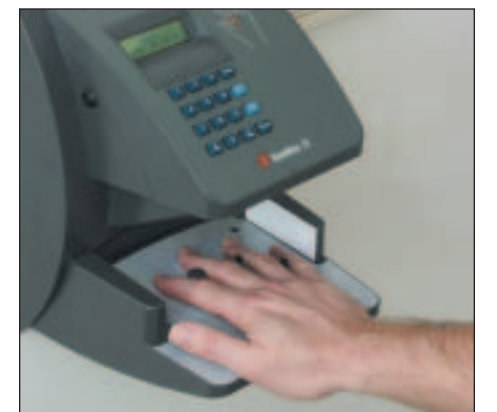
Biometric hand readers used for employee access